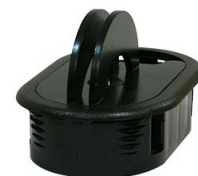
Table Top Mounting Bracket