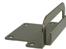
Table Side Mounting Bracket